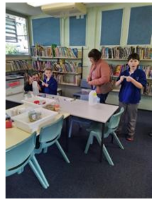
Bird Feeder making